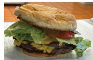
Actual Double Cheeseburger Made By: Stephen!

Bottle Sodas $1.85 Minute Maid $1.85 Powerades $1.60 Water $1.50 Can Sodas $1.10