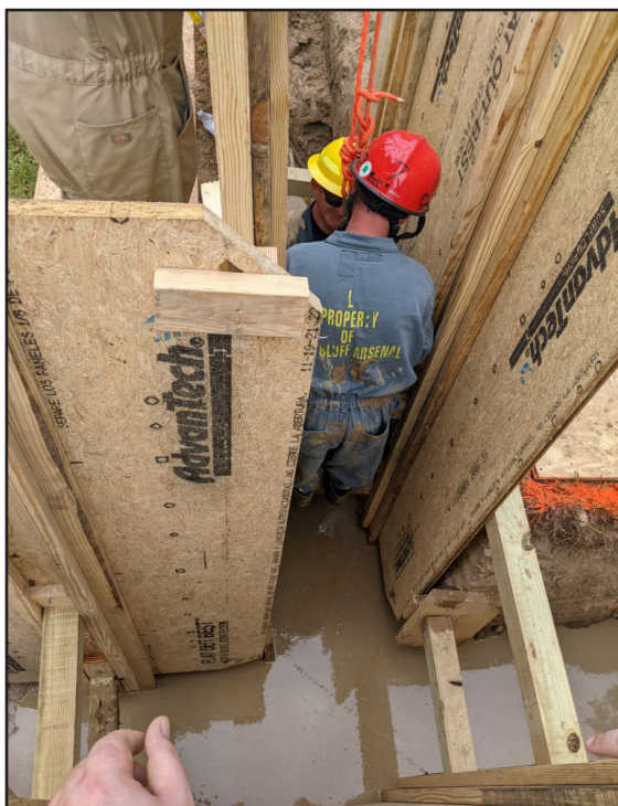
Pine Bluff Arsenal firefighters secure 4x4 boards to ensure the sides of the trench do not collapse during a training.

"There are different levels to this class and we will just space everything out, starting with the basics."