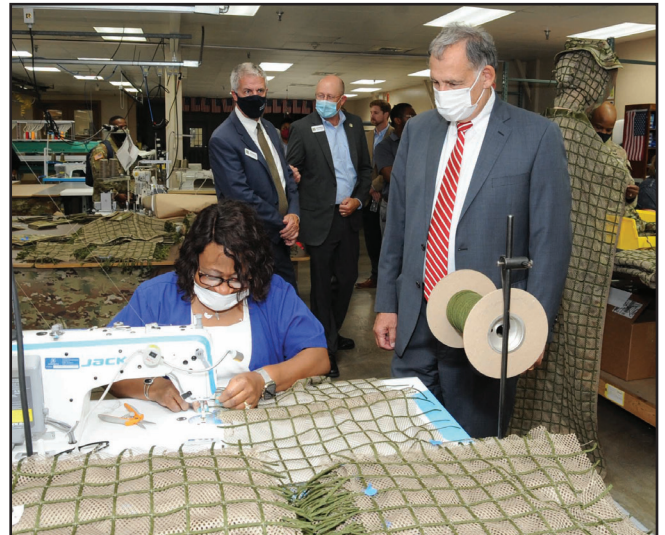
Photo right, Arkansas Senator John Boozman listens as Bridgett Walker shows fabric used to make the Integrated Footwear System during a tour of Pine Bluff Arsenal's Protective Clothing/Textile production area Aug. 11. Photo above, Senator Boozman watches as Dee Webb sews on a Ghillie suit.