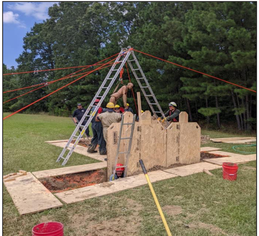
Pine Bluff Arsenal fire department crews set up an "A" frame to conduct a rescue training using shoring panels built earlier during one of the rescue classes. The Arsenal's fire department has been conducting a series of rescue trainings since 2020.

sonnel just completed trench rescue training. "Trenches are being dug here on PBA on a weekly basis," said Wade. "The Directorate of Public Works does a good job with their safety, even in the confined space. We are here in case DPW's training fails. We are a safety net."