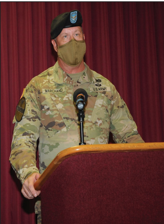
Col. Tod T. Marchand, Pine Bluff Arsenal's 40th Commander, speaks during a Change of Command ceremony July 28 at Creasy Auditorium. The ceremony was limited to just family members and broadcast via Facebook due to COVID-19 restrictions.